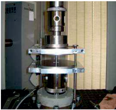
Fig. 1. Compression tests