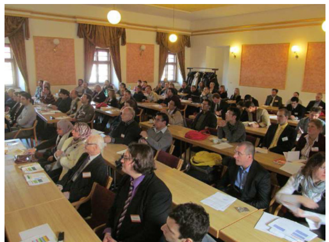
View into a Lecture Room