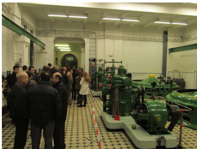
Excursion into Historical Hydro Power Station in Hradec Kralove