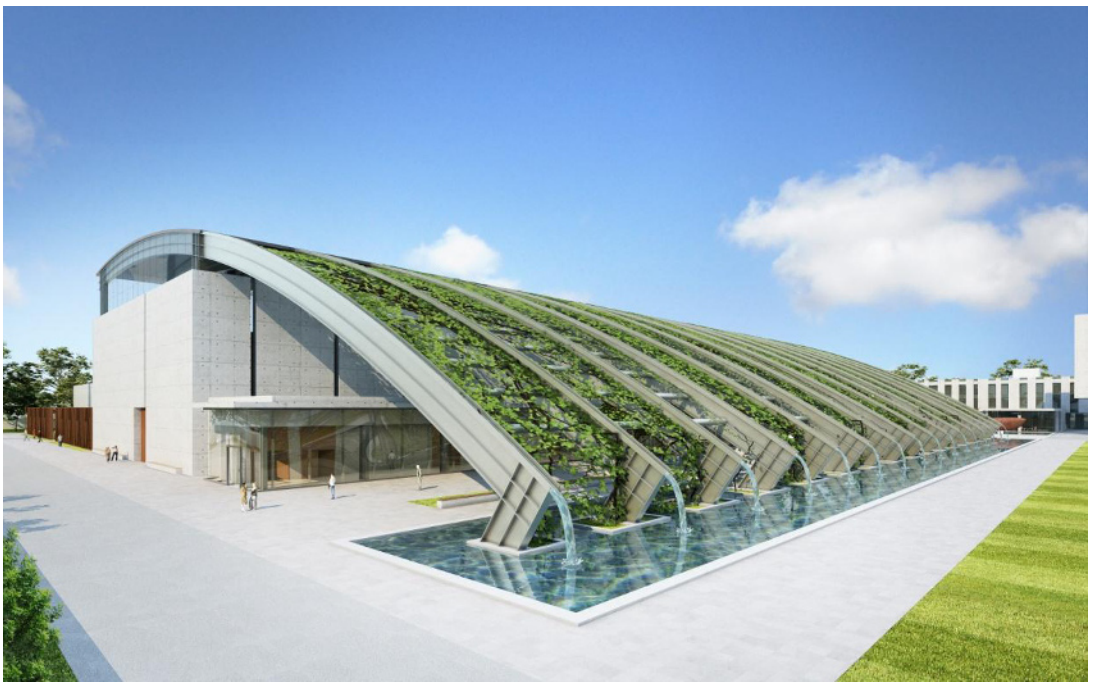
Figure 1. Architect's vision of the main buildings complex at ELI-NP: laser building, accelerator and experiments building, laboratories building.

The ELI-NP infrastructure will consist of a High Power laser system and a High Intensity Gamma Beam system. The latter will produce a highly collimated beam of radiation in the gamma ray domain, through the Compton backscattering of a laser beam off a beam of accelerated electrons produced by a linear accelerator. Both systems will be hosted by a building complex shown in Figure 1. The construction of the building complex started in May 2013 and will be completed in the spring of 2015.