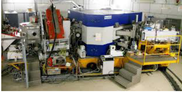
Figure 1: A view of MAGNEX spectrometer at Laboratori Nazionali del Sud in Catania.