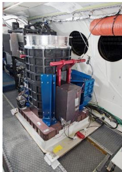
Fig. 2. The double-pulsed 2- \mu m CO 2 IPDA lidar integrated instrument inside the NASA B-200 research aircraft

The theoretical differential optical depth was derived using CAPABLE meteorological data and CO 2 in-situ gas analyzer (LiCor; LI-840A) and US standard model [5]. In addition, the IPDA measured differential optical depth was converted to CO 2 dry mixing ratio, and was compared to the in-situ gas analyzer at the site. General agreement of the CO 2 temporal profiles were observed between these two measurements, verifying the 2- \mu m IPDA lidar operation.