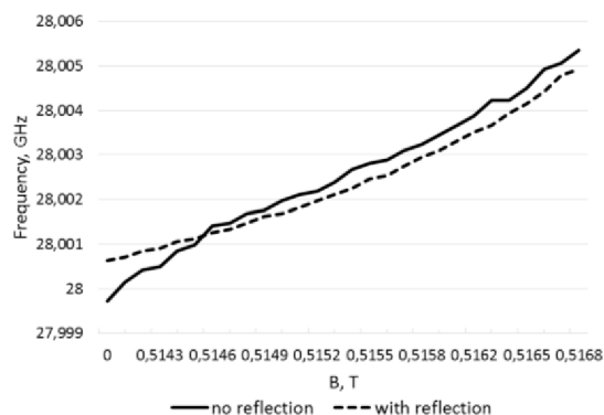
Fig. 1 Experimental dependence of frequency on the magnetic field with and without reflections

This can be explained by the change of the Q-factor of the complex resonator, consisting of gyrotron resonator and the waveguide section up to the reflector. The movement of the reflector in the range of wavelength can double the Q-factor, leading to better stability of the frequency.