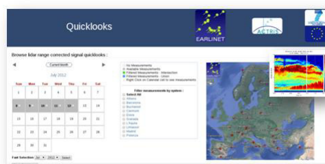
Figure 2 Web interface of the new EARLINET quicklook database.

The standardized and quality-assured pre-processed lidar data have been also used to develop a homogeneous network-wide, open and freely accessible quick-look database (high-resolution images of time-height cross sections). The quick-look database is now in the testing phase and will be externally accessible starting from June 2017.