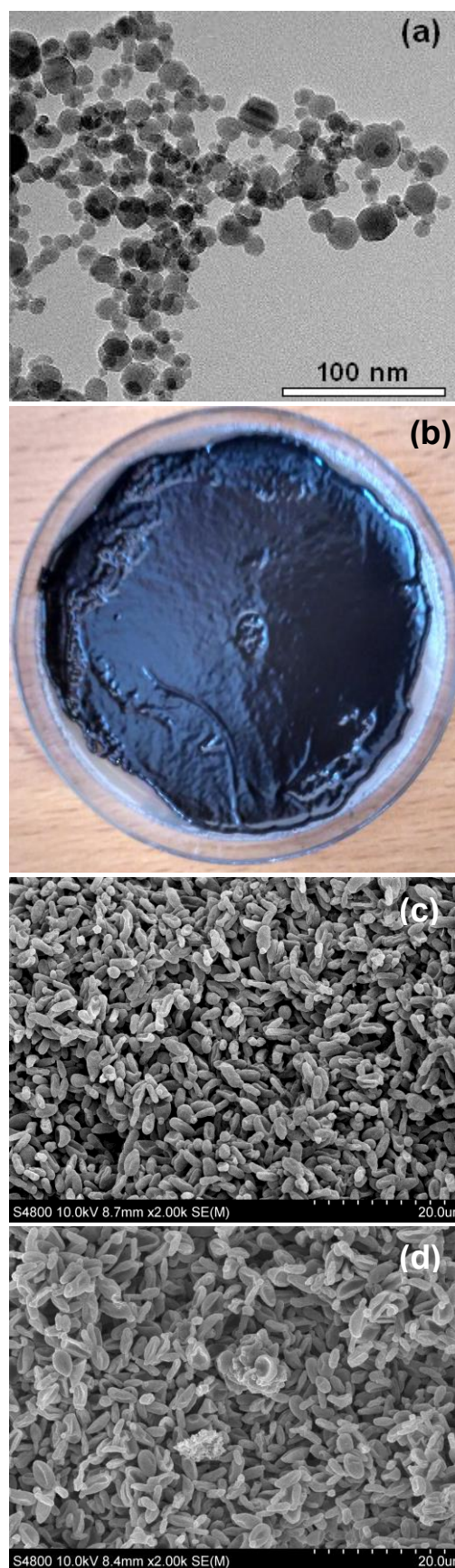
Fig. 1. LTE iron oxide MNPs, TEM (a). Petri dish with E. Nigrum grown onto solid nutrient medium without MNPs (b). General view of E. Nigrum grown in the presence of 0 (c) or 10^4 MPD (d) of iron: MPD of iron provided by MNPs.

XRD spectra gave a mean crystallite size for air-dried MNPs of 19 \pm 2 \text{ nm} in a good agreement with TEM and specific surface area evaluation. Fig. 1 shows the air-dry