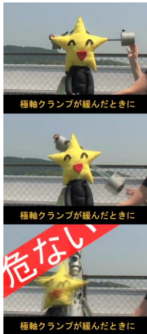
Figure 3. The risk of unsafe attachment of counterweights

Figure 4 shows the risk of forgetting to tighten the thumbscrew of the counterweight shaft. It shows a counterweight falling on a foot of a pupil/student.