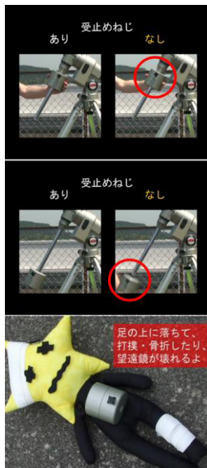
Figure 4. The risk of forgetting to tighten the thumbscrew of the counterweight shaft.