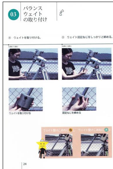
Figure 6. A page of the manual.

developed video. The photos of the middle and lower rows indicate the enlarged photos of work points and risks by wrong acts, respectively.