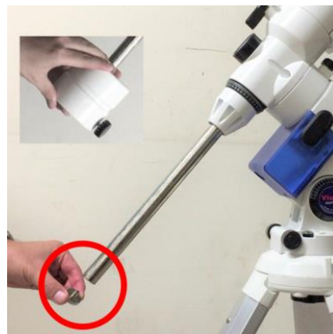
Figure 2. Thumbscrew of the counterweight shaft

When in-service teachers assemble astronomical telescopes at their schools, many pupils and students may gather around the teachers and the telescopes. The above-mentioned acts (3) and (4) are especially unsafe at the schools. In the case of (3) many teachers and students attached a counterweight to the counterweight shaft from the top. If a lock lever is loose, the counterweight would swing like a pendulum and it could hit the pupil's/student's head. In the case of (4) some teachers and students forgot to tighten the thumbscrew of the counterweight shaft. If a screw of the counter weight is loose, the counterweight could fall on a foot of a teacher, pupil, or student. Both cases cause a big accident and serious injury such as a fracture.