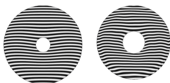
Fig.1. Model interferogram of the required wavefront (left) and the one actually obtained in the process of machining (right).

As an example, let us describe a number of projects on the production of large-dimensioned optical mirrors using membrane-pneumatic support.