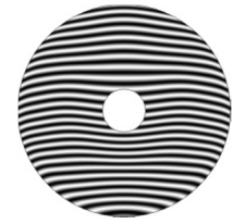
Fig. 3. Model interferogram of the required wavefront and parameters of wavefront deviations.