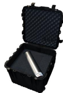
Fig. 8: Picture of the compact radionuclide identification unit in its rugged transportable case

The system is designed to maximize portability, with a weight lower than 3 kg that may be further optimized reducing the volume of the installed detector.