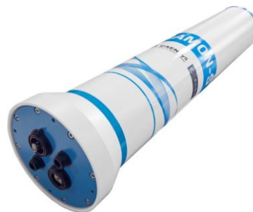
Fig. 5: Picture of the gamma radiation spectroscopy system for real-time radiation monitoring

To be operated as a station it mounts batteries, optional solar panels and is provided with wired and wireless communication interfaces: USB 2.0, Ethernet, WiFi and 3G/4G LTE.