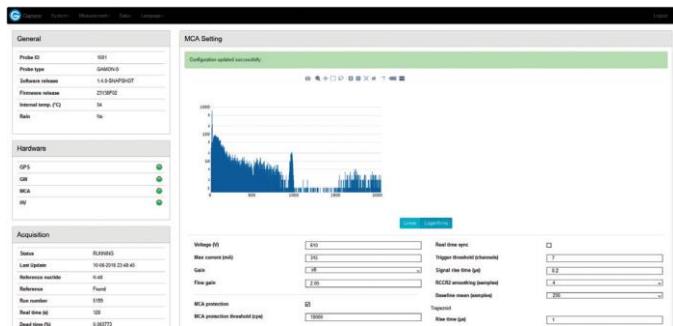
Fig. 2: Web page available to the administrator of the system, to set the operational parameter of the spectrometer

The station can signal radiological alarms or malfunctions automatically to the central monitoring facility or directly to operators through phone messages or emails. Different levels of alarm can be configured on the dosimeter measurement, on the neutron counting, on the spectrometer count rate and on the dose rate associated to identified peaks in the spectrum.