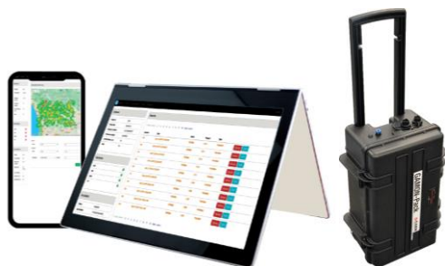
Fig. 6: Picture of the portable and discrete radionuclide identifier

of alarm an acoustic signal, a short vibration or a message can be configured as warning notification.