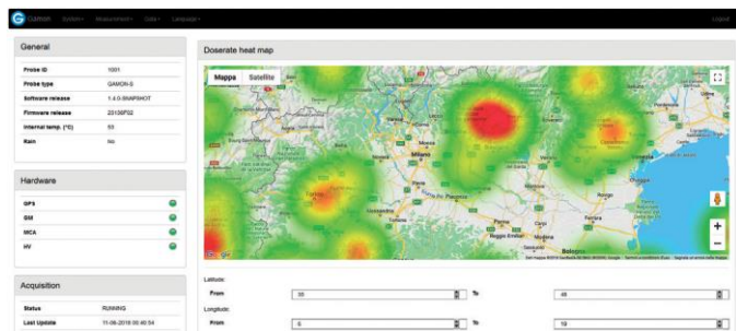
Fig. 3: Web page to visualize the count rate, dose rate or isotope presence in the form of a heat map

The network software is the perfect tool for wide area coverage applications or the monitoring of sensitive locations or events to have a safer and clearer monitoring overview.