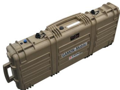
Fig. 7: Picture of the vehicle mountable gamma spectrometric system in its rugged case

It is designed to make radiometric measurement and identification of gamma emitters on wide areas providing a map of the radioactivity detected. The real time identification algorithm can recognize artificial gamma emitters beyond the natural background and mark the hot spot over the trajectory travelled by the moving vehicle. This feature allows the user to make a map of the radioactivity of the scanned area.