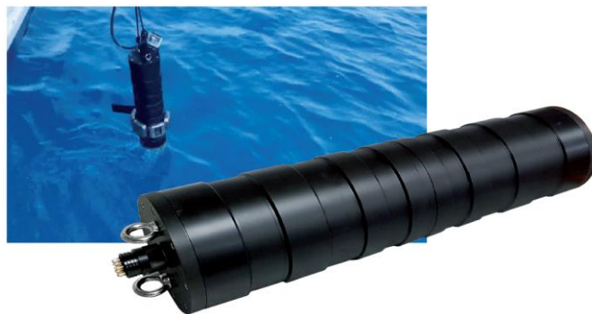
Fig. 9: Picture of the underwater system for radionuclides identification and an on-field use of the system for monitoring the sea contamination

The system was designed to offer the best combination of portability, low power consumption and performance.