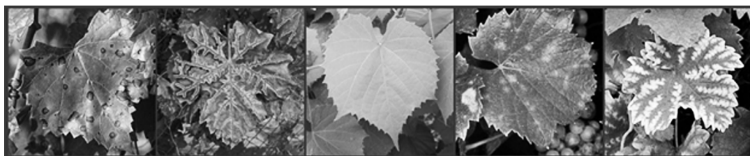
Figure 1. Example of images from PDD database

We collected our database from different open sources (guides, encyclopedias, forums). We reduced the image sizes and extracted only meaningful parts. At the very beginning, the PDDP database has only grapes leaves photos – 130 healthy leaves, and 30–70 images with Esca, Chlorosis and Black Rot diseases, one can see examples of images in Fig. 1. But a set of 313 images is too small even for transfer learning and leads to overfitting the classifier. One of the way to train a deep neural network on a small data is the one-shot learning, in particular the siamese networks [7].