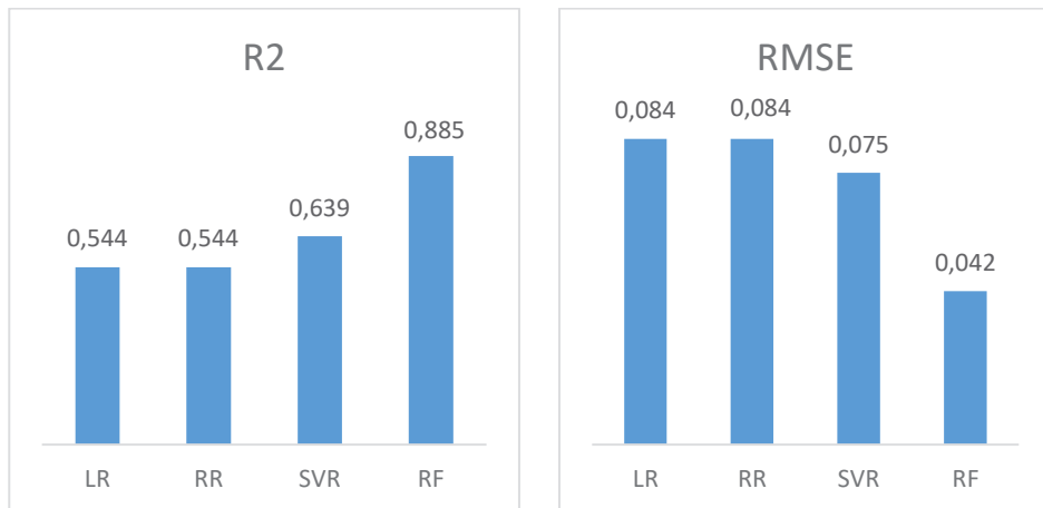
Figure 2: Performance metrics for trained ML algorithms

88,5 % of the variance in the data. Furthermore, RF demonstrated the lowest root mean squared error (RMSE), underscoring its superior predictive accuracy and robustness in capturing nonlinear relationships and interactions within the dataset. Similar trends have been reported by Li et al. [5], where ensemble-based algorithms outperform linear and kernel-based models in predicting thermal conductivity of heterogeneous materials.